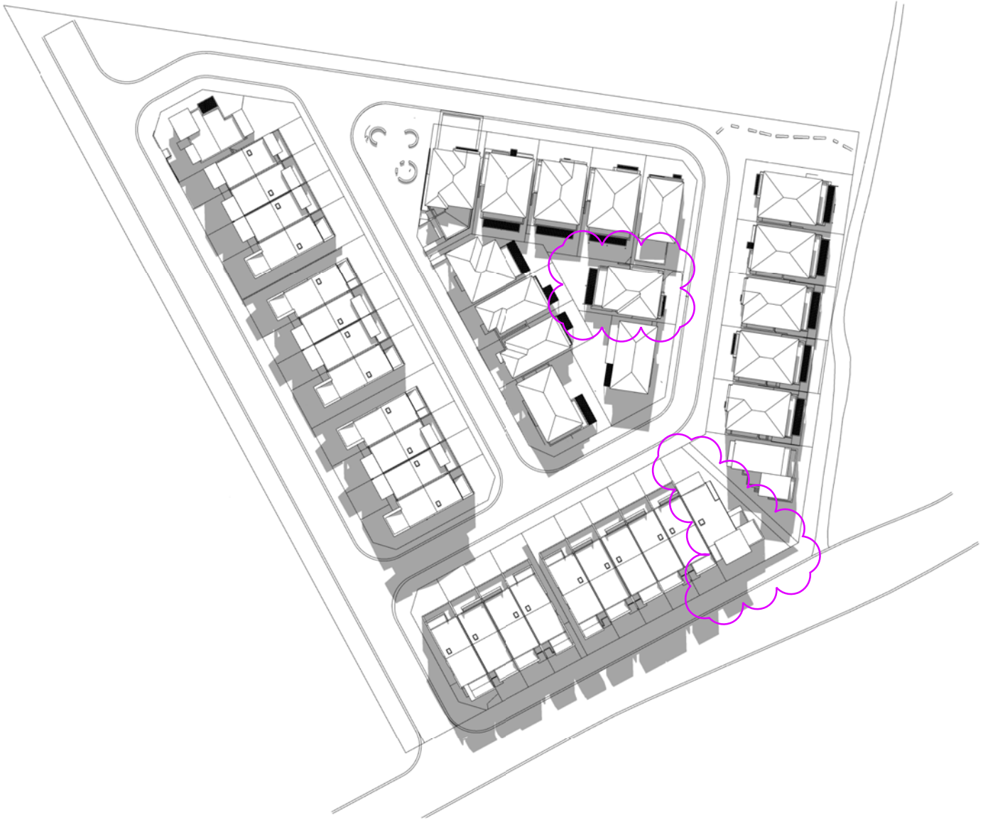
4 21 JUN 12PM - WINTER SOLSTICE SHADOW DIAGRAM