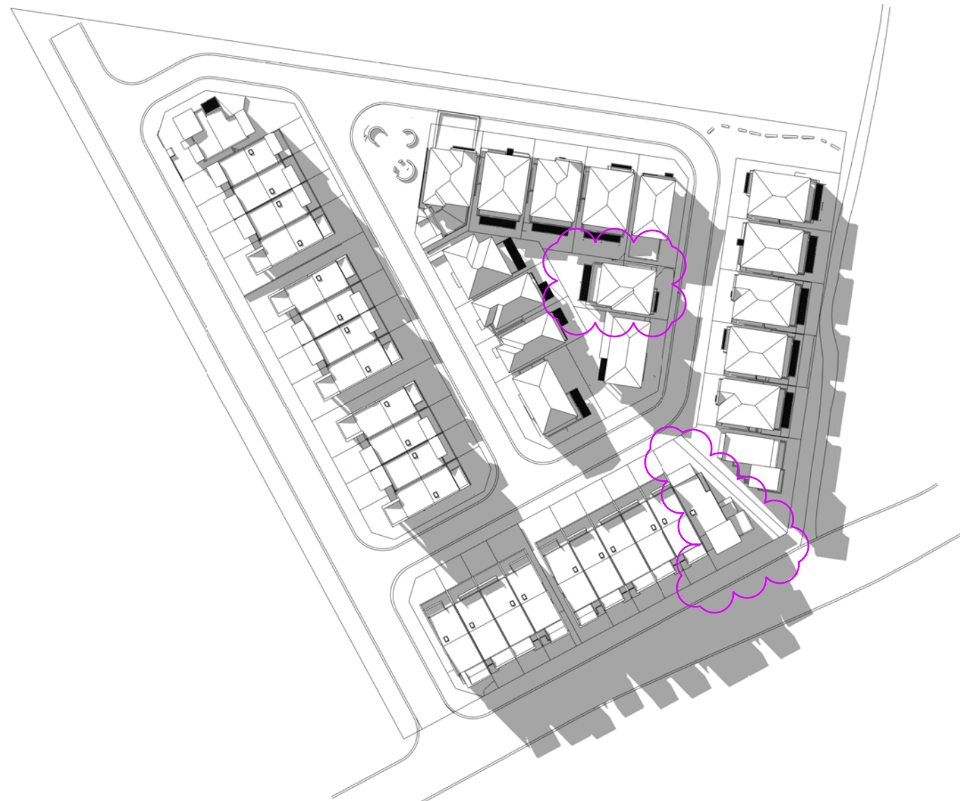
7 21 JUN 3PM - WINTER SOLSTICE SHADOW DIAGRAM