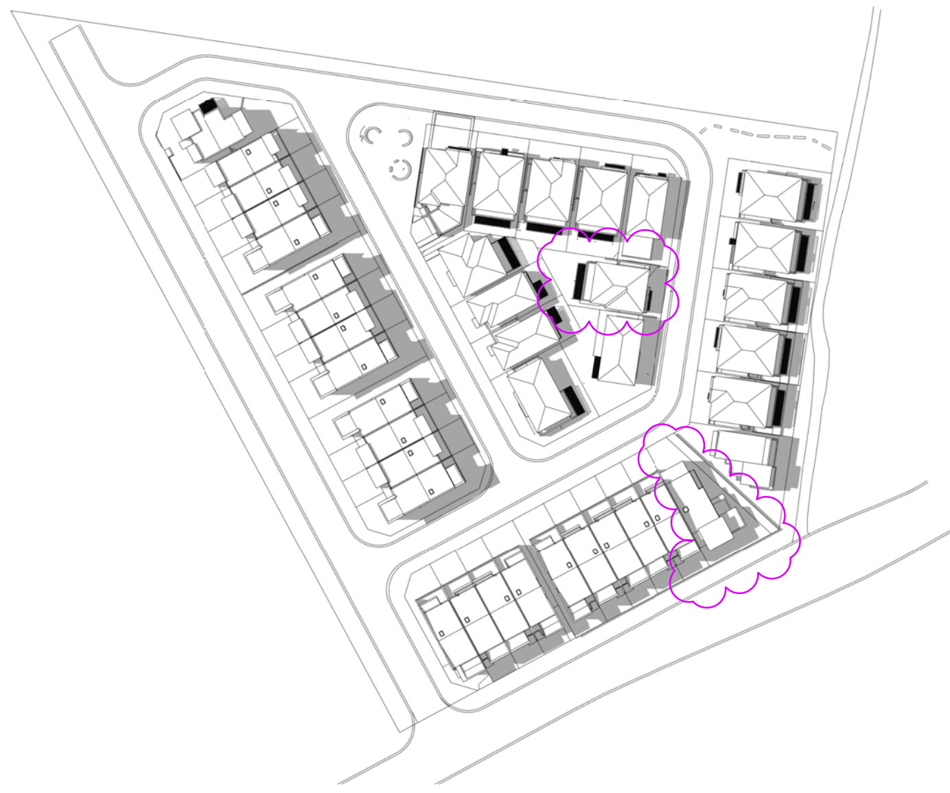
10 21 DEC 3PM - SUMMER SOLSTICE SHADOW DIAGRAM

© copyright of dem (aust) Pty limited abn 92 085 456 844. any unauthorised use or distribution of information depicted on this document without dem (aust) Pty limited prior consent is prohibited. any reports, drawings, advice or information included or referenced that is prepared and/or provided by any other party, including the client/principal, is the sole representation of the party who prepared the report/drawings, advice or information and does not constitute a representation by dem (aust) Pty limited. dem (aust) Pty limited expressly takes no responsibility for any documents, advice or other material prepared by any other party.