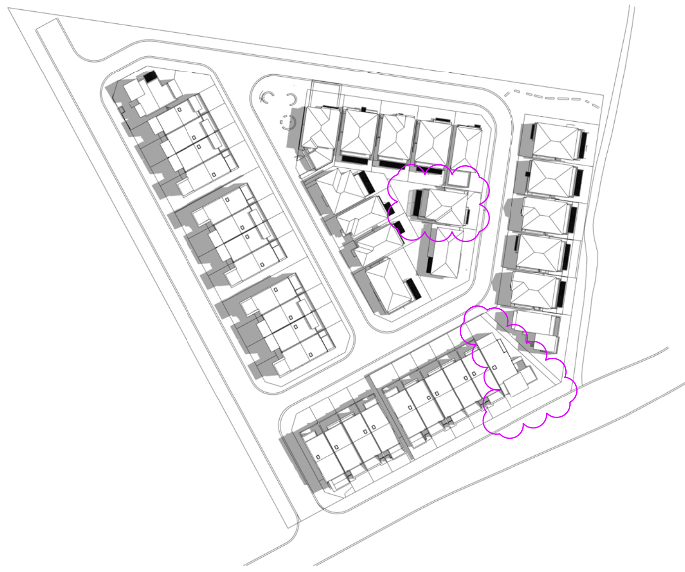
8 21 DEC 9AM - SUMMER SOLSTICE SHADOW DIAGRAM