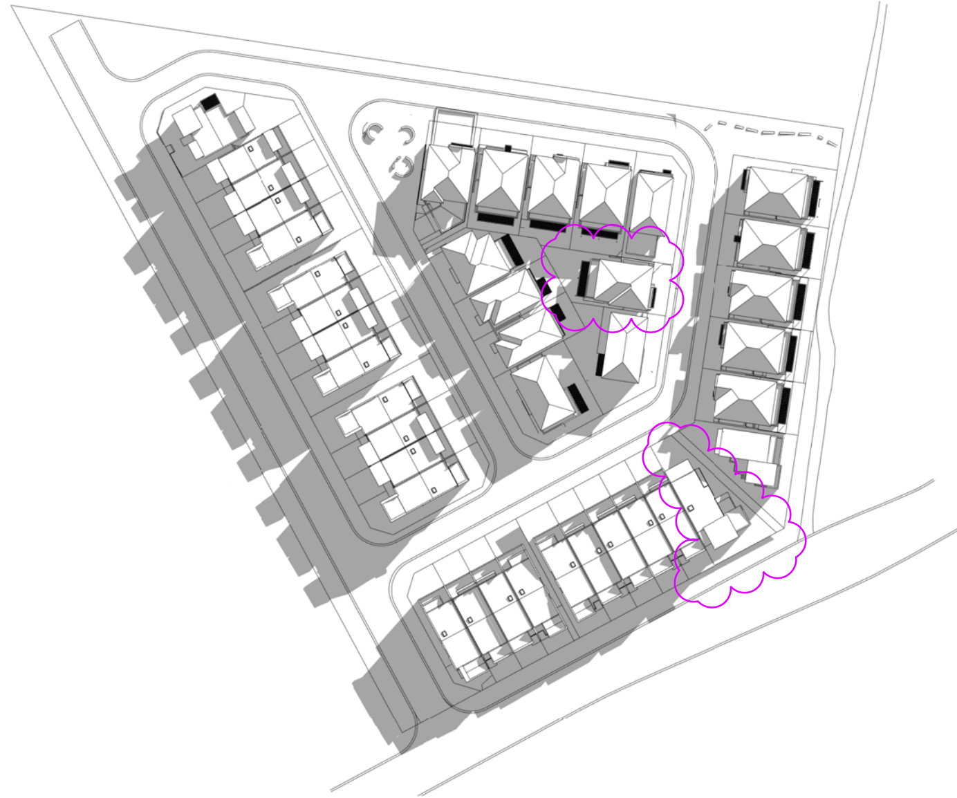
1 21 JUN 9AM - WINTER SOLSTICE SHADOW DIAGRAM