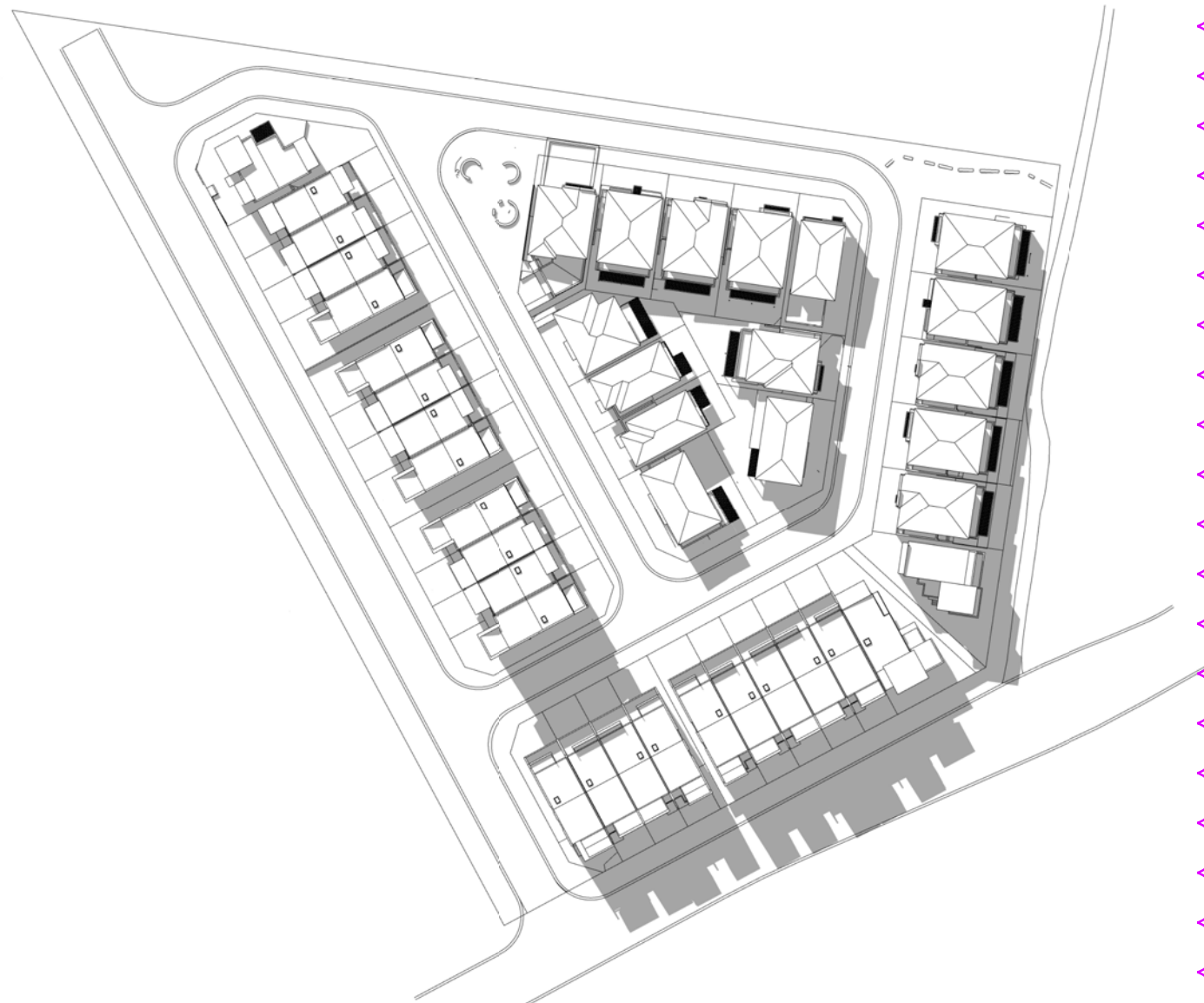
6 21 JUN 2PM - WINTER SOLSTICE SHADOW DIAGRAM