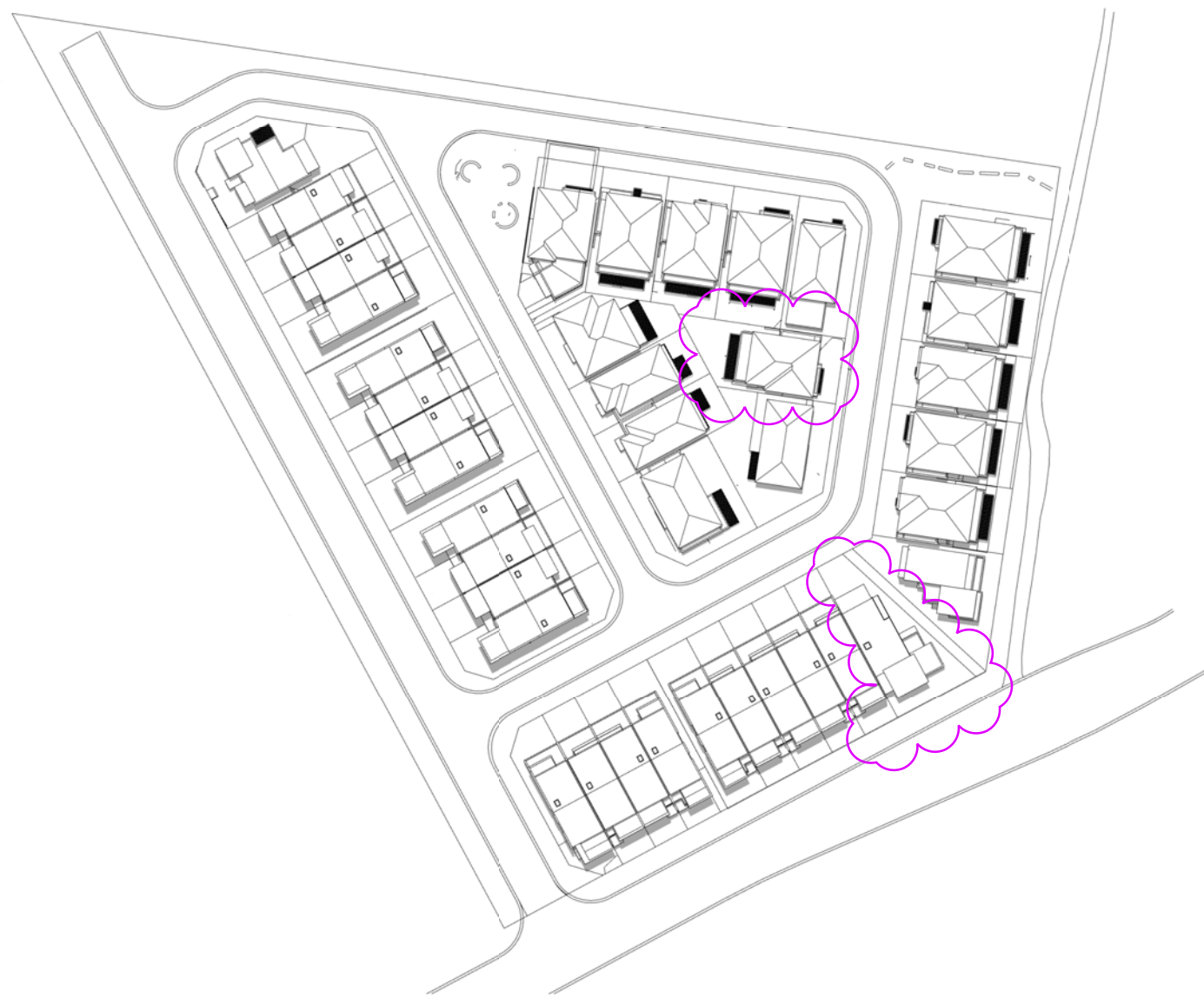
9 21 DEC 12PM - SUMMER SOLSTICE SHADOW DIAGRAM